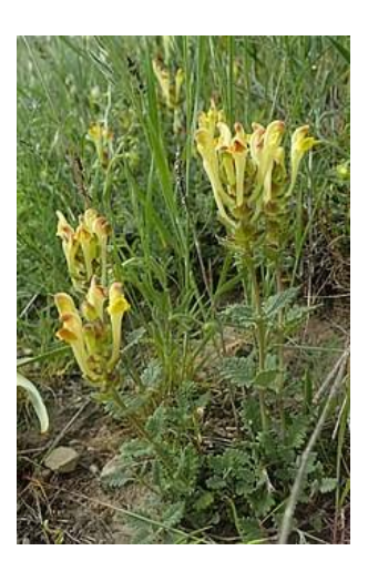
Figure 1. Scutellaria orientalis L. subsp. virens (Kotcshy & Boiss.) J. R. Edm. during flowering.