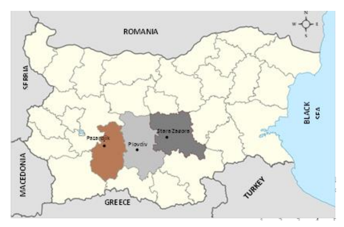
Figure 2. Map of Bulgaria with pointed out the area with infection of A. besseyi.

On rice, populations of A. besseyi higher than 30 nematode/100 seeds can cause economical losses (Yamaguchi, 1977). Therefore, about 87.9 % of the infected seed samples, in this experiment, had more than 30 nematodes per 100 seeds (48 to 396 nematodes / 100 seeds), a threshold, creating a need for management programs in order to prevent greater crop losses.