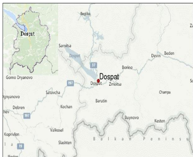
Figure 1. Map of Dospat Municipality

The medicinal plants found in the territory of Dospat Municipality were 332 plant species. Their distribution according to phylum is as follows: Equisetophyta- 4 species; Polypodiophyta- 5 species; Pinophyta- 3 species and Magnoliophyta- 320 species (Table 1). As it can be seen from Table 1, the medicinal plants found belong to 75 families. The families with the largest species diversity are presented in Figure 2 in descending order as follows: Asteraceae - 40 species; Lamiaceae - 35 species; Rosaceae - 31 species; Apiaceae -19 species; Fabaceae - 19 species; Scrophulariaceae - 15 species; Caryophyllaceae - 11 species; Brassicaceae - 10 species; Boraginaceae - 9 species; Ranunculaceae - 7 species. Three families ( Geraniaceae , Polygonaceae and Rubiaceae ) were represented by 6 species, three families –by 5 species, six families –by 4 species, seven families –by 3 species and twelve families – by 2 species. The largest number of families, i.e. 34 families were represented by only one species, such as the families Aquifoliaceae , Chenopodiaceae , Grossulariaceae , Cuscutaceae , Cyperaceae , Juglandaceae , Lythraceae , Menyanthaceae , Oxalidaceae , Parnassiaceae , Polypodaceae , Valerianaceae , etc.