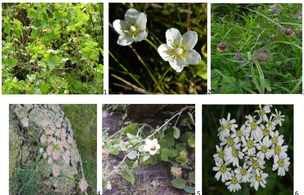
Figure 4. Pictures of some medicinal plants of conservation importance

Legend: 1- Ribes nigrum : Red List (CR), Red Book (CR), BDA; 2- Parnassia palustris : IUCN-LC; 3- Geum rivale : IUCN-LC; 4- Seseli rhodopaeum : Bulgarian endemic, Red List-NT; 5- Campanula lanata : Balkan endemic, Red Book (VU), Red List (VU), BDA, IUCN (DD); 6- Achillea grandifolia : Balkan endemic.